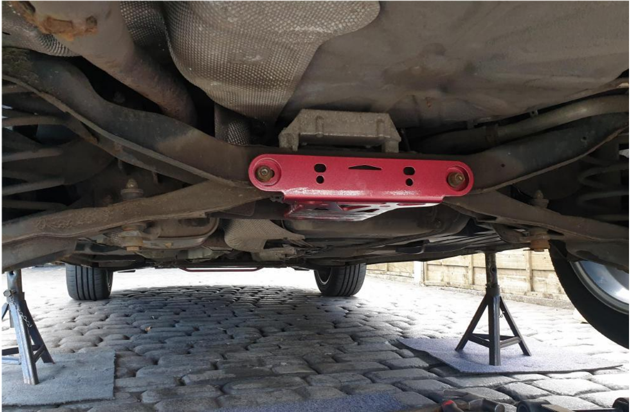
BAR-135 Rear Lower Chassis Link Bar (pair)